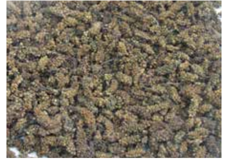
Sang Shen Zi