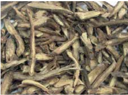
Shan Dou Gen