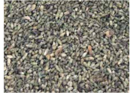
Huai Hua Mi