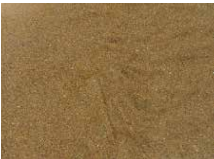
Che Qian Zi