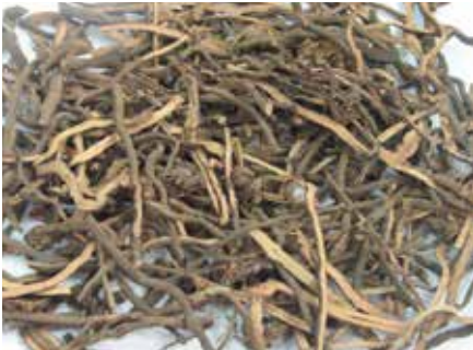
Qian Cao Gen