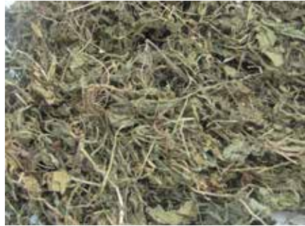
Zi Hua Di Ding