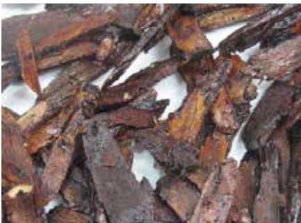
Zhi Gan Cao