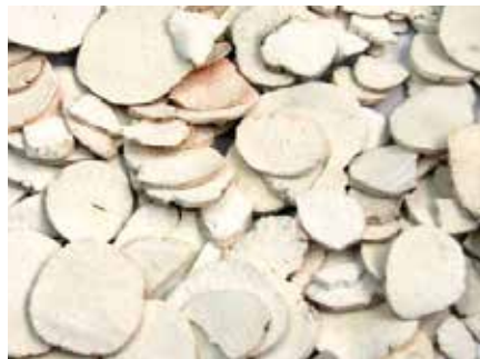
Tian Hua Fen