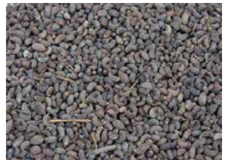
Nu Zhen Zi