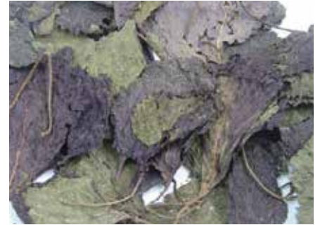
Zi Su Ye