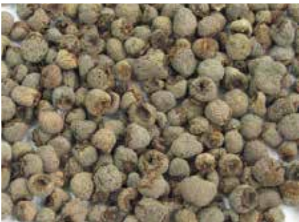
Fu Pen Zi