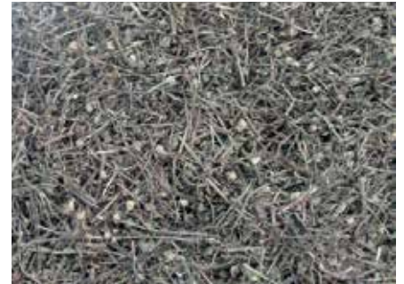
Bai Hua She She Cao