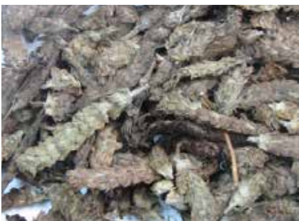
Xia Ku Cao