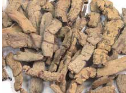
Ba Ji Tian