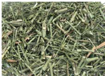
Chuan Xin Lian