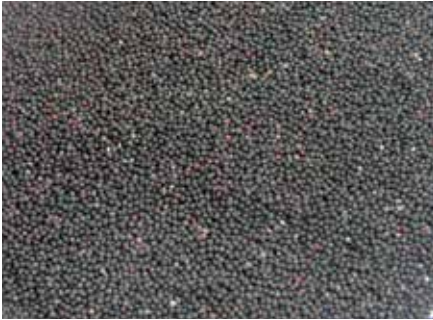
Wang Bu Liu Xing