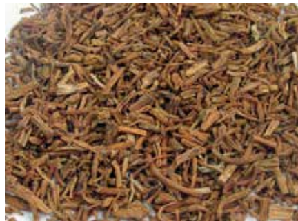
Xi Xian Cao