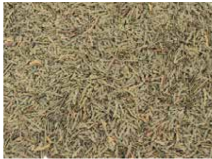
Ce Bai Ye