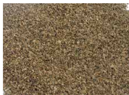
Di Fu Zi