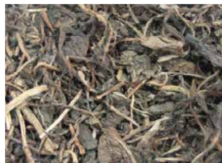
Da Qing Ye