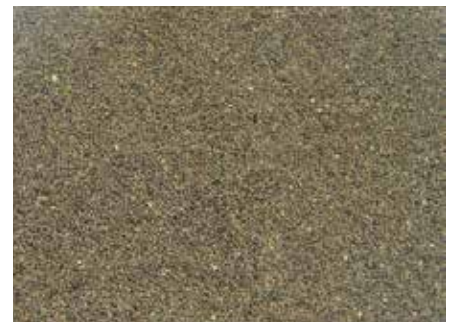
Tu Si Zi