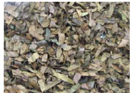
Pi Pa Ye