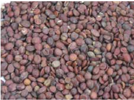
Suan Zao Ren