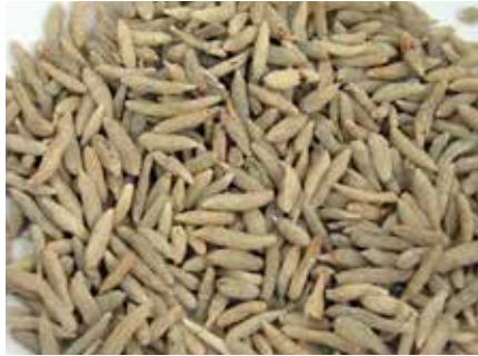
Mai Men Dong