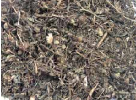
Pu Gong Ying