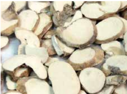
Zhe Bei Mu