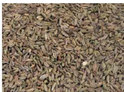
Xiao Hui Xiang