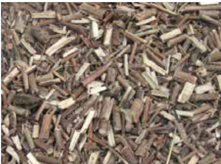
Bai Jiang Cao