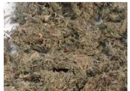
Yin Chen Hao