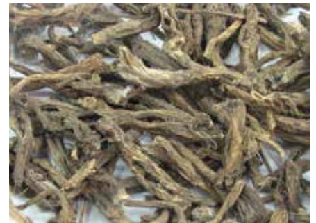
Bai Tou Weng