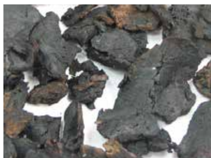
Sheng Di Huang