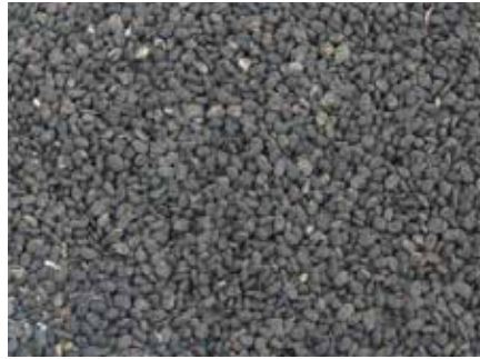
Bu Gu Zhi