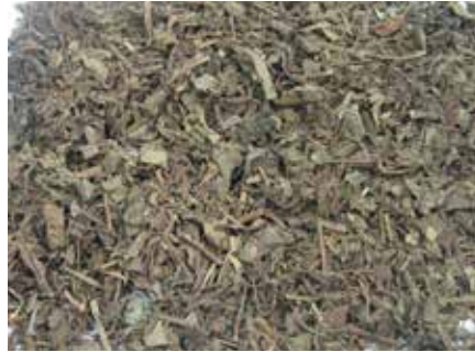
Yu Xing Cao