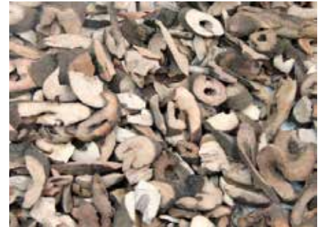
Mu Dan Pi