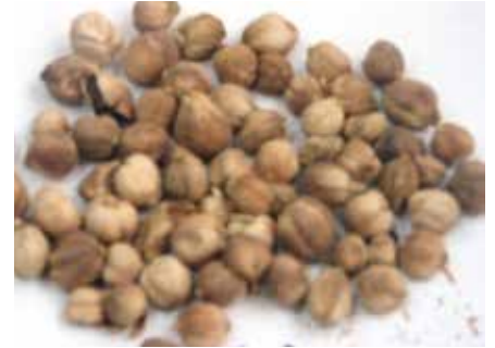
Bai Dou Kou