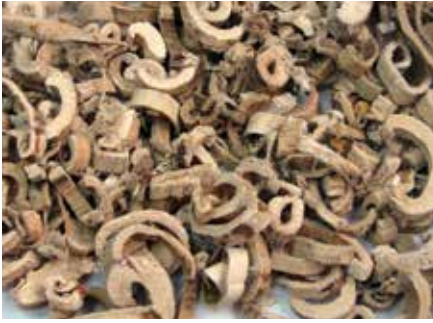
Sang Bai Pi