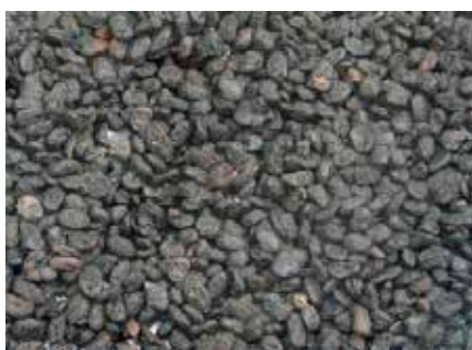
Dan Dou Chi