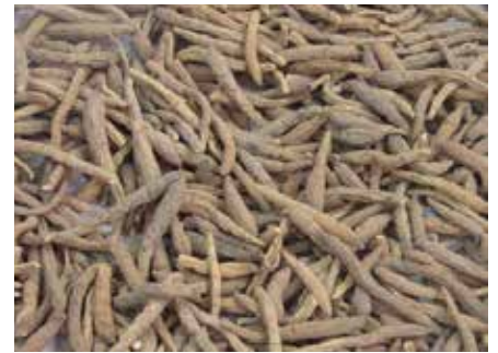
Tai Zi Shen