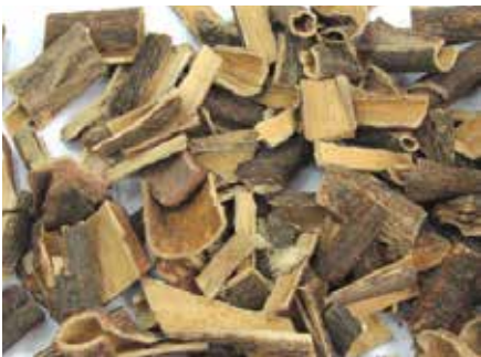
He Huan Pi