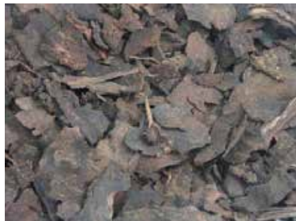
He Shou Wu