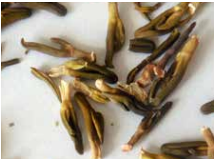
Lian (Zi) Xin