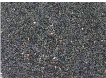
Hei Zhi Ma