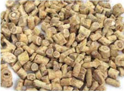
Bei Sha Shen