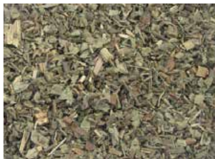
Xian He Cao