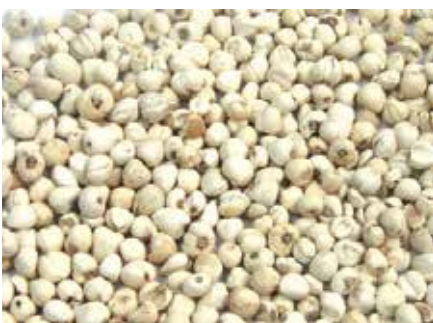
Chuan Bei Mu