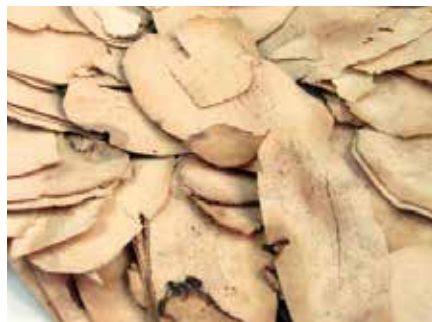
Tu Fu Ling