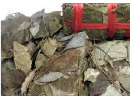
Yin Yang Huo