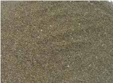
Zi Su Zi