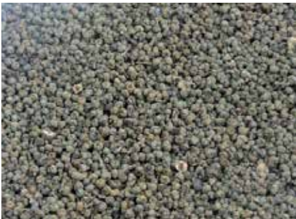
Wu Zhu Yu