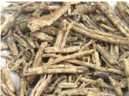
Bai Xian Pi