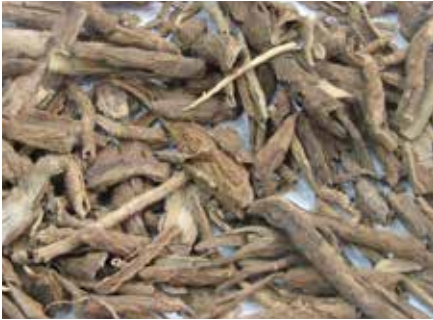
Di Gu Pi