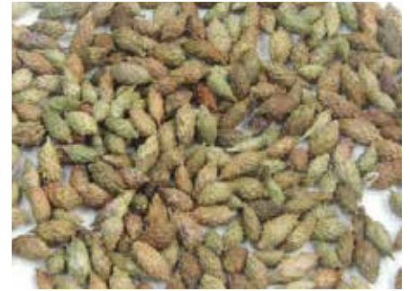
Cang Er Zi