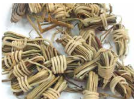
Deng Xin Cao