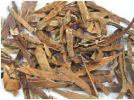
Gua Lou Pi