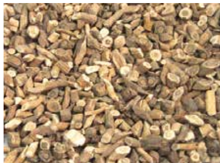
Ban Lan Gen